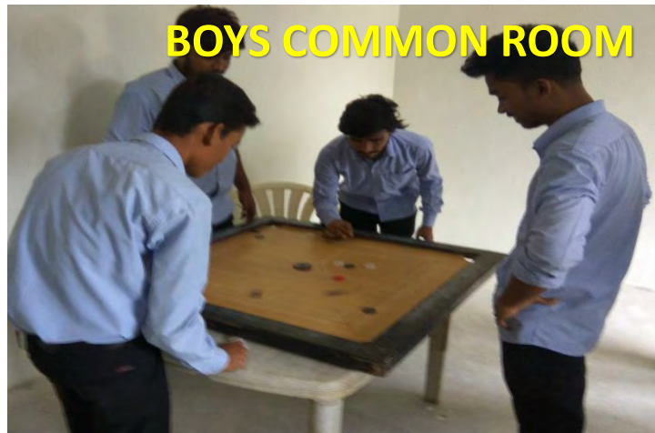
BOYS COMMON ROOM